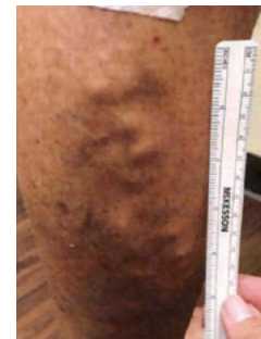
Figure 2. Left Calf Pre-treatment