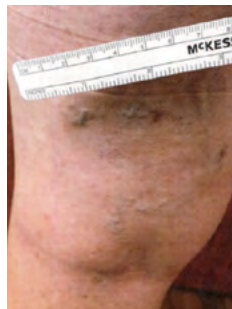
Figure 3. Left thigh one-month post-Varithena treatment